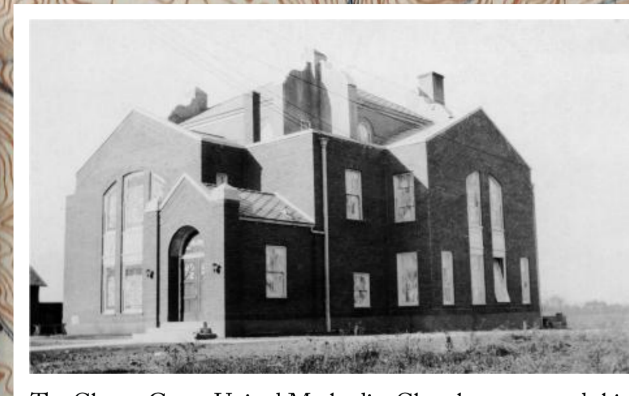
The Cherry Grove United Methodist Church constructed this church at the corner of Beechmont Avenue and Eight Mile Road in 1925. In 1969 the church moved to Eight Mile Road. McCall's Flooring now occupies this building.