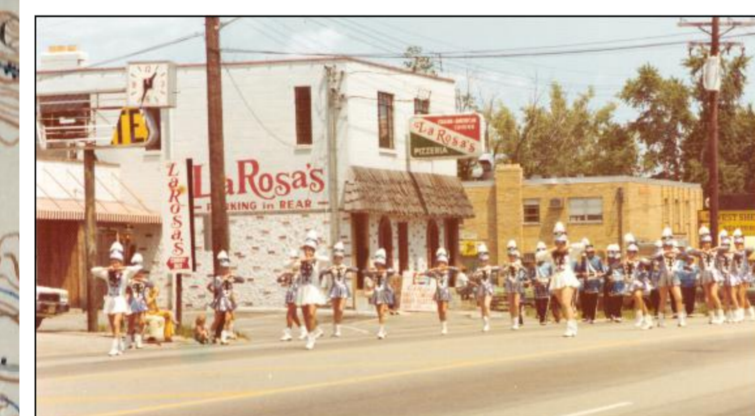
LaRosa's Pizzeria opened in Anderson Township in 1974 at 7756 Beechmont. In 1985, LaRosa's constructed the restaurant building now on the site. (Photo ca. 1980.)