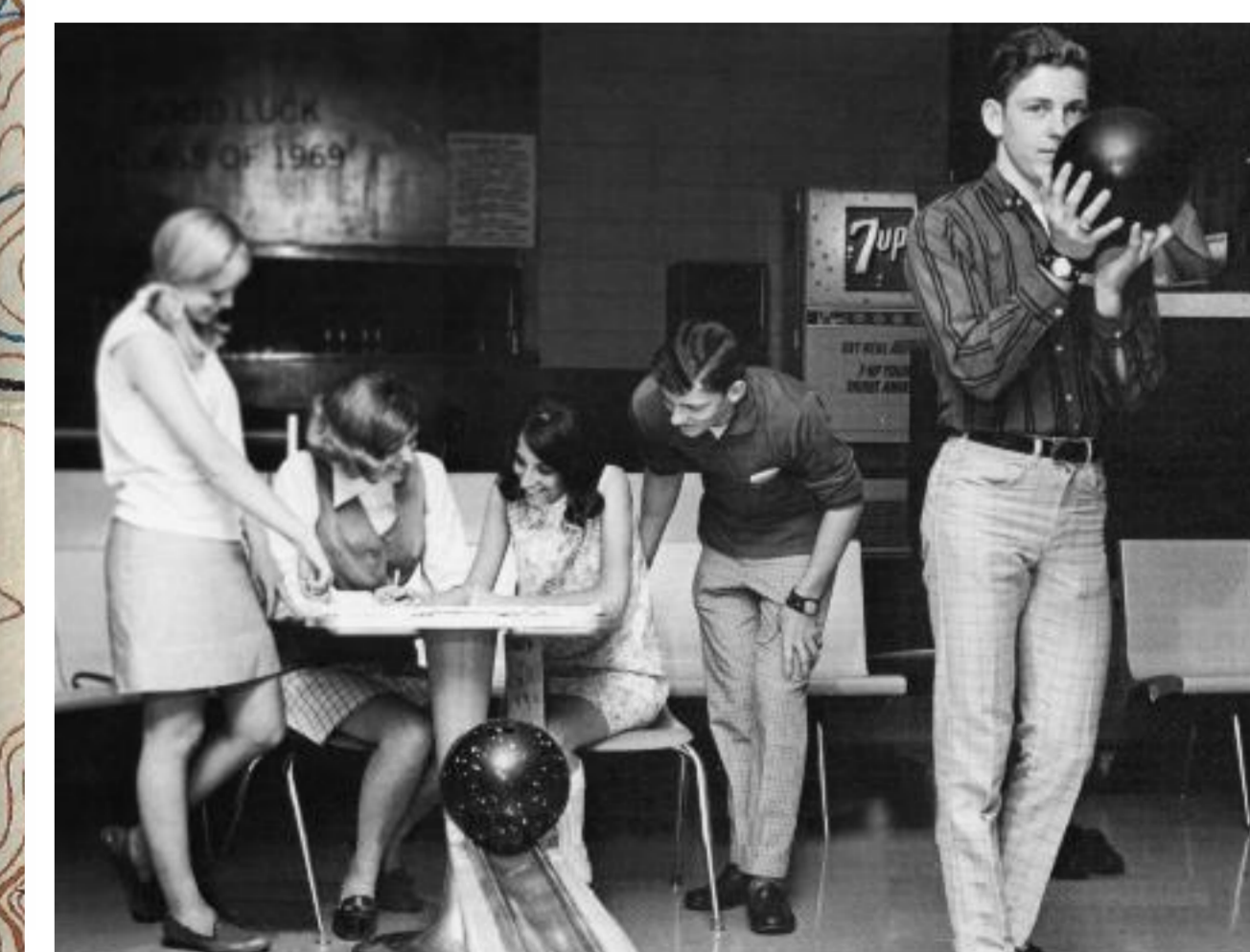
King Pin Lanes at 7735 Beechmont was a popular spot for all ages for nearly 50 years. Advertisements from the 1960s promoted Saturday "All Star" bowling tournaments and fine drinks at the Thunderbird Lounge. (Photo 1969.)

Note: Present-day road and place names have been added to the map.