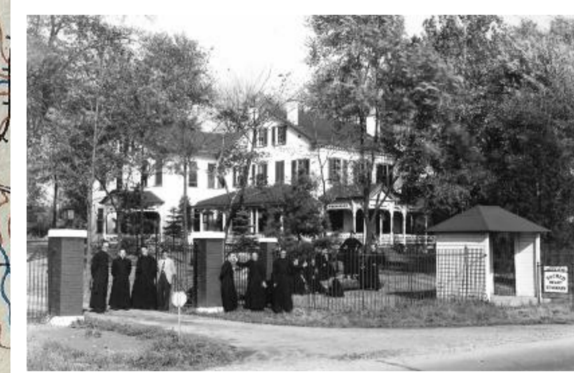
Comboni Missionaries, priests and students gather in front of the original building on Beechmont Avenue on the grounds where Sacred Heart Seminary was going to be built. The seminary was part of the Sons of the Scared Heart, now Comboni Missionaries, and is the national headquarters. Photo about 1947.