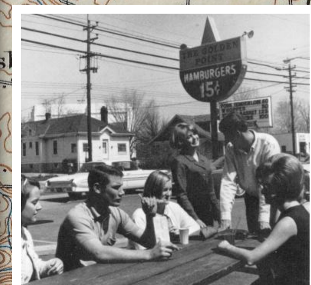
Golden Point was a popular stop for a sandwich at 7825 Beechmont in the 1960s. Notice the large outdoor screen of the Forest Auto Theater showing above the roof of the house across the street. (Photo 1967.)