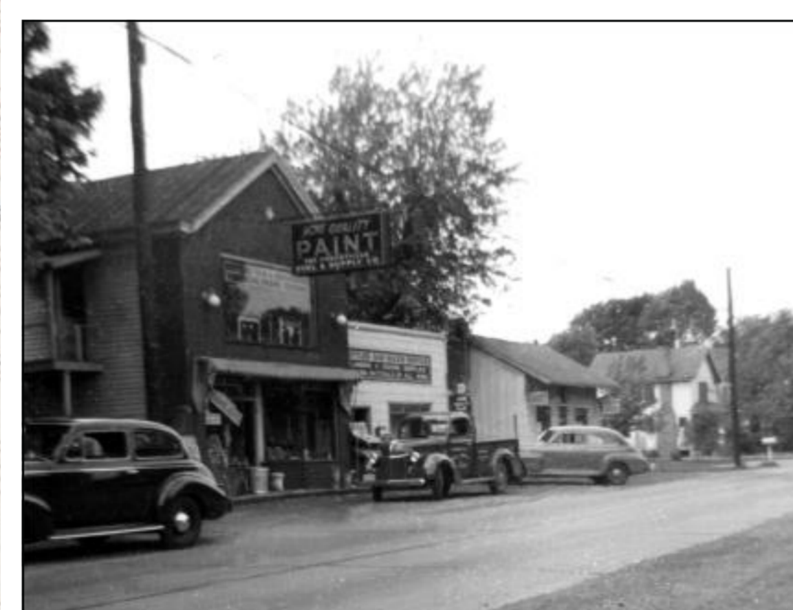
Forestville Fuel & Supply Company in 1942 stood on the south side of the road. Today this is the Festival Market area with FedEx Office and Panera Bread.