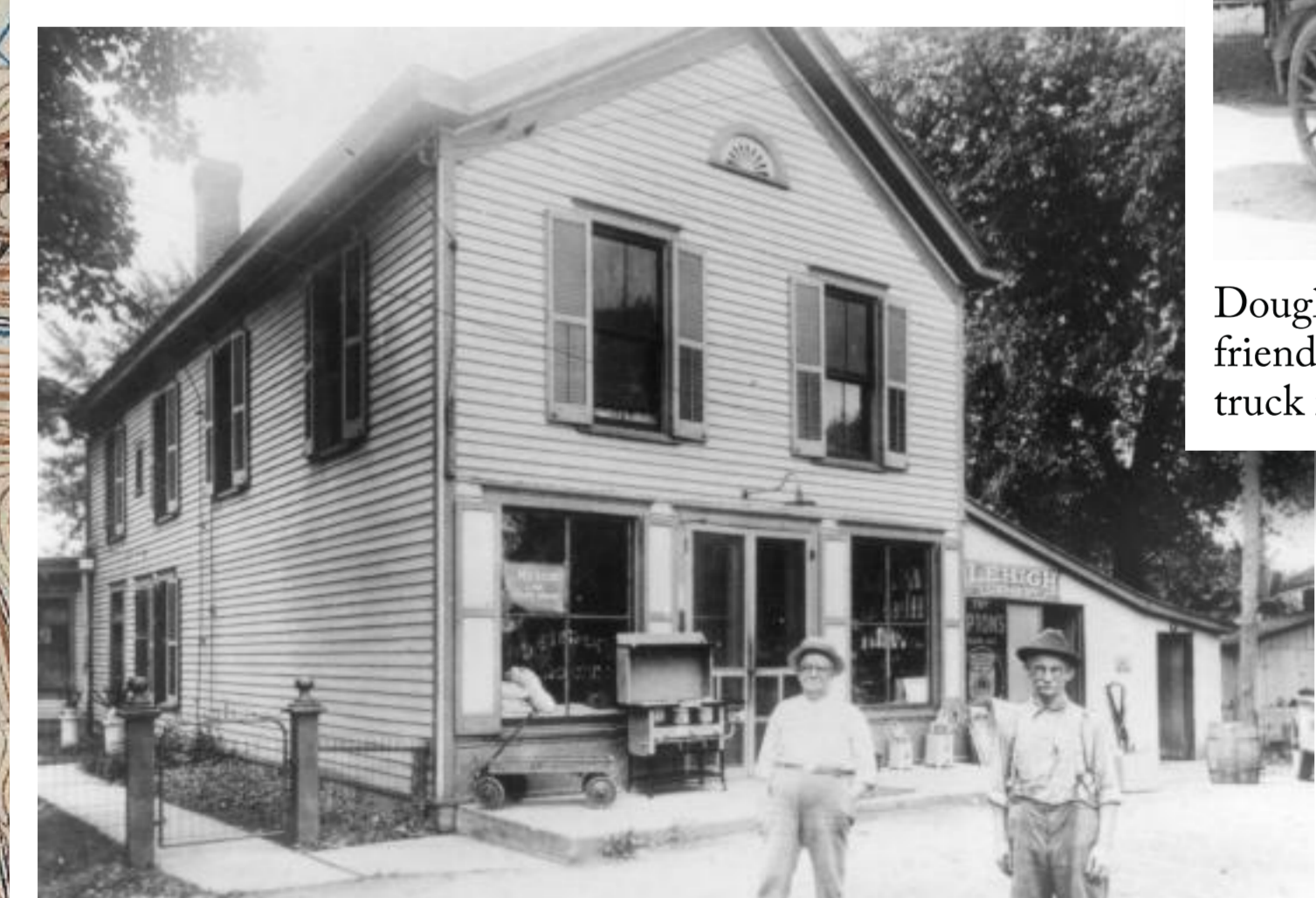
In the early 1900s, the D. Sheldon Hardware store was on the south side of Beechmont Avenue in Forestville. It sold a wide variety of wares. (Photo ca. 1923.)