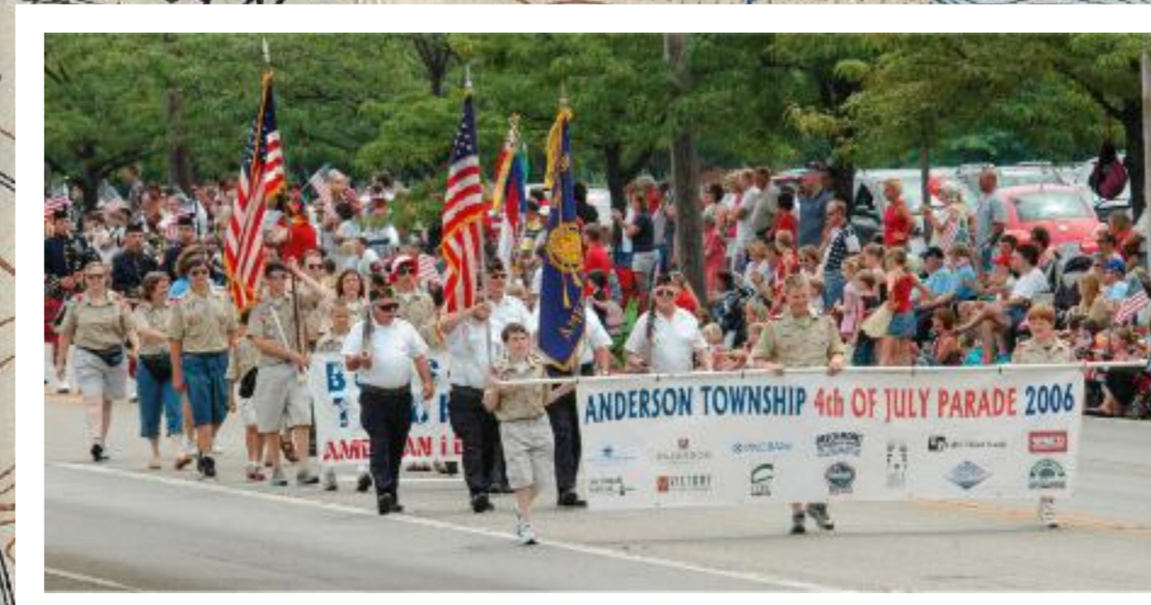
The Fourth of July Parade has become a community tradition, with thousands lining the streets each year for the event.