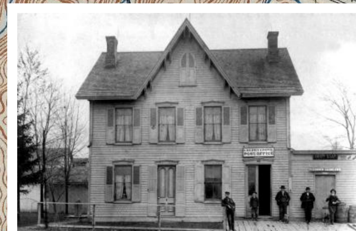
Areas along today's Beechmont Avenue are still associated with the names of the early local post offices used before home delivery. The Cherry Grove Post Office operated in George Powell's grocery store for more than 30 years at Beechmont Avenue and Eight Mile Road. (Photo 1906.)