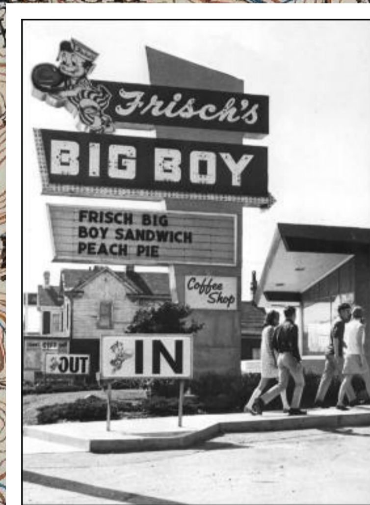
Cincinnati-based Frisch's Big Boy has been a familiar sight for nearly 60 years. Before fast food drive-thrus, Frisch's offered curb service to your car. (Photo 1969.)